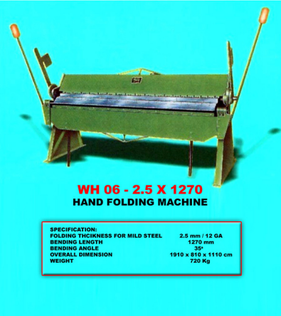
WH 06 - 2.5 X 1270 HAND FOLDING MACHINE

Importer & Main Distributor Of China, Korea, Japan, Jerman, Itali Precision Machinery & Industrial Tools Mesin Bubut CNC, Machining Center China/Taiwan/Jepang, Mesin Kayu, Mesin Kertas Travo las AC-DC, Travo las Inverter, Travo las FIB, Travo las CO 2 etc.